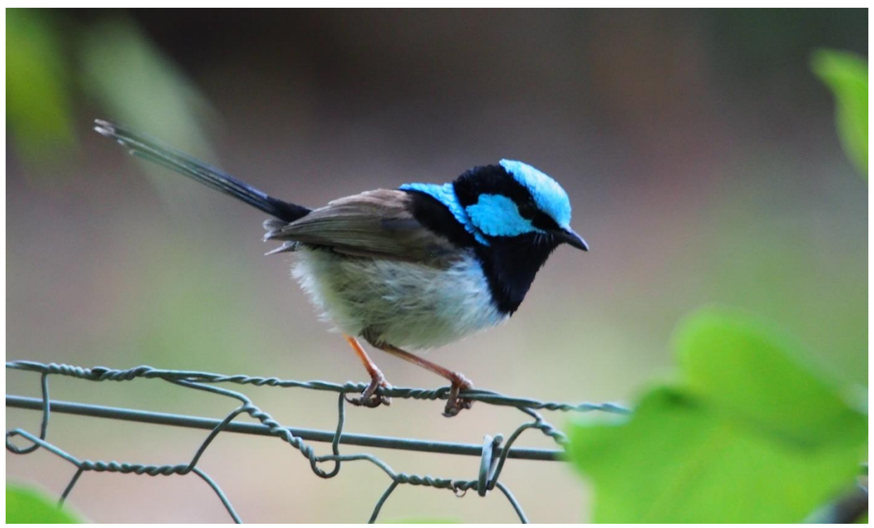
Male Superb Fairy Wren, Scientific Name: Malurus cyaneus

Open Gardens South Australia is a not for profit organisation opening private gardens to the general public.