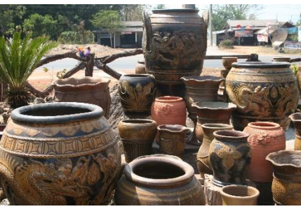
engraved in shallow relief with swirling dragons swimming among waves and flying among clouds.

The fascination has played out inside and out with a pleasing collection of blue and white wares from China that we use to hold a number of variegated hosta plants standing on the dry soil under a big variegated holly tree. Elsewhere a large Vietnamese fish-sauce fermenting jar stood in the garden – now stolen it reminds me every-time I pass where it stood of the rotten opportunism of some scoundrels. There are also several hard, dense terracotta pots