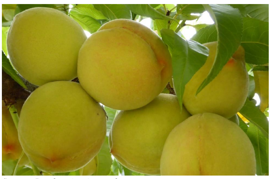
Summer Peaches ripening on the tree.

Summer has arrived and Christmas is just around the corner! The "lazy days of summer" provide a tantalising image of rest and relaxation, so we hope you have time to enjoy the season without too much stress from holiday preparations. Tis the season of giving and sharing and this edition features three stories highlighting how OGSA and our garden owners support charities and the community. Enjoy the summer season with all it has to offer....and from OGSA, we wish you and your family and friends a very happy and safe Christmas.