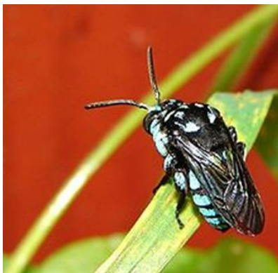
Cloak and dagger cuckoo bee Thyreus spp.

Collecting honey from Australian native bee nests can cause many of the bees to drown in spilt honey. The honey is tangy in comparison with commercial honey taken from the European Honey bee. The bees store their honey in small resinous pots which look like bunches of grapes.