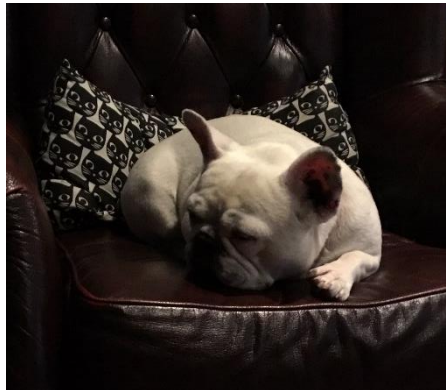
Photo: Daisy the French bulldog.

A collector at heart I am seriously addicted to growing plants and planting seeds, and to books and reading. The results are a garden crowded with plants and 3 rooms of our house crowded with books; gardening books of course – including plant monographs, plant hunter’s biographies, garden histories, translations from Latin, French, Italian, Spanish, Russian, Chinese and Japanese books; design and style books, garden literature, rare illustrated tomes and even a few humorous books. Did you know Capt. W. E. Johns (author of the Biggles adventure books for children) wrote a funny garden book? It is called THE PASSING SHOW (Dent, 1937).