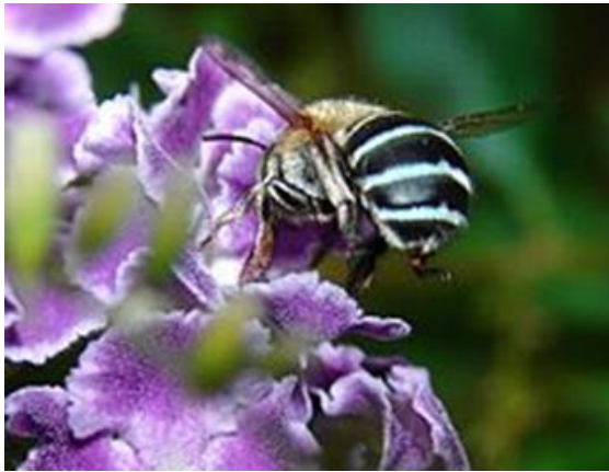
Australian Blue Banded Bee Amegilla spp.

Australia has over 1,500 species of native bee. Bees collect pollen from flowers to feed their young. Wasps and flies do not do this, although they may be seen eating pollen, so identification is not always easy.