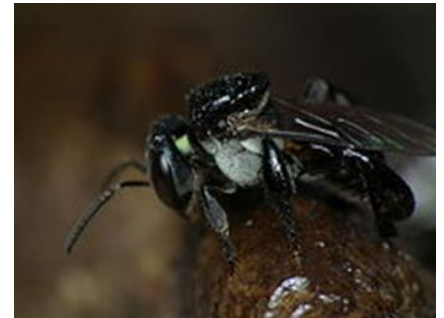
Australian Sugarbag Bee Tetragonula carbonaria

Amegilla ("blue-banded bees") for pollinating hydroponic tomatoes, while some hydroponic growers are petitioning for the introduction to the Australian mainland of the European bumblebee, Bombus terrestris . Australia has a history of sensationally poor outcomes from introduced species, the most famous example being that of the cane toad Bufo marinus — so the question of the use of native vs introduced bees for pollination in Australia is controversial.