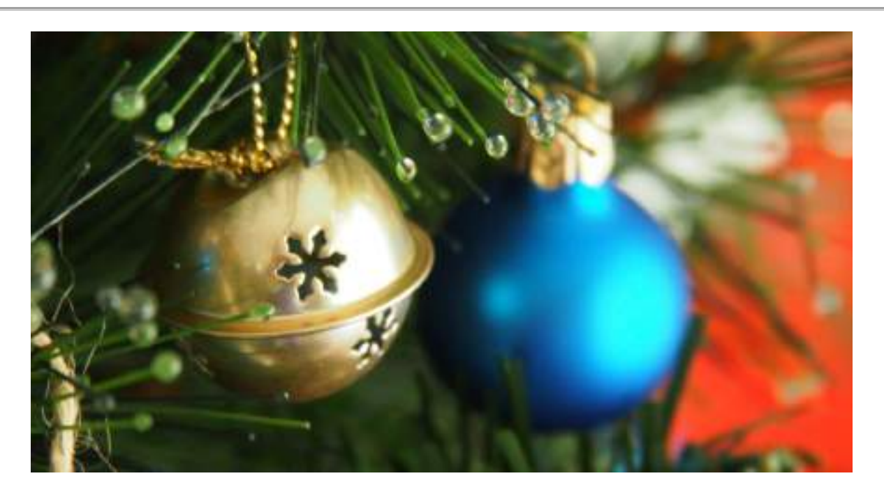
The Committee of Open Gardens SA wish you and your loved ones a safe and Happy Christmas.

Open Gardens South Australia is a not for profit organisation opening private gardens to the general public.