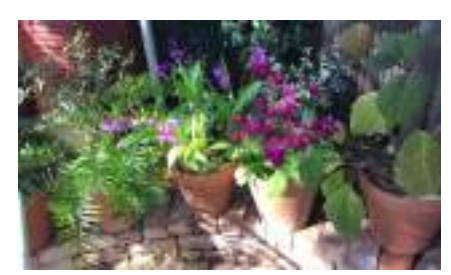
Hector's Patch, Mile End