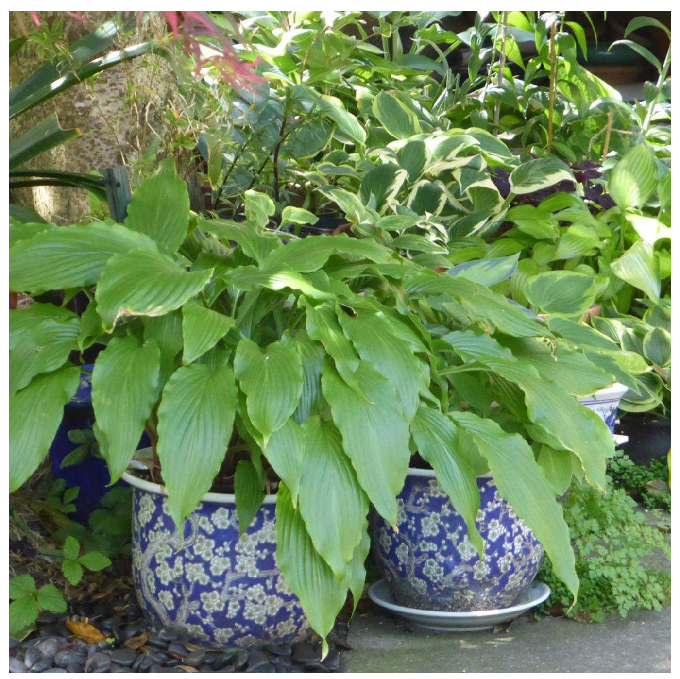
Trevor Nottle's Hostas displayed in blue and white 'Chinese' style pots