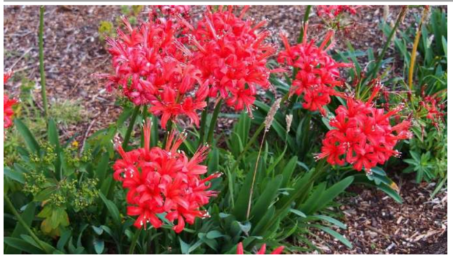
Autumn Flowering Bulbs

This past Summer has been one many people will not remember with much fondness or joy. The massive Bushfires across the country have caused so much devastation, sadness and deep distress to many people – the loss of lives, homes, gardens, infrastructure, livestock and the tragic loss of so much of our unique wildlife. A very sad time indeed. Autumn brings refreshing, cooler weather, and welcome rain. At Open Gardens SA we hope you will take some time to relax, enjoy the Autumn weather, visit an open garden and especially take time to visit our inaugural SA Landscape Festival on the weekend of the 4 and 5 April 2020. The details, and a web link to book tickets, can been found on page 2 of this Newsletter. We hope to see you in the garden soon!