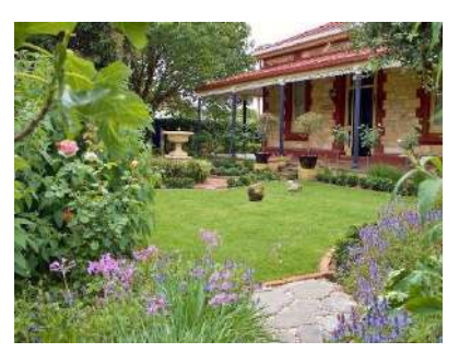
Churston, West Croydon