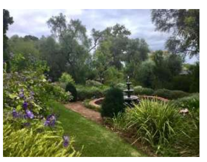
Beaumont House, Beaumont